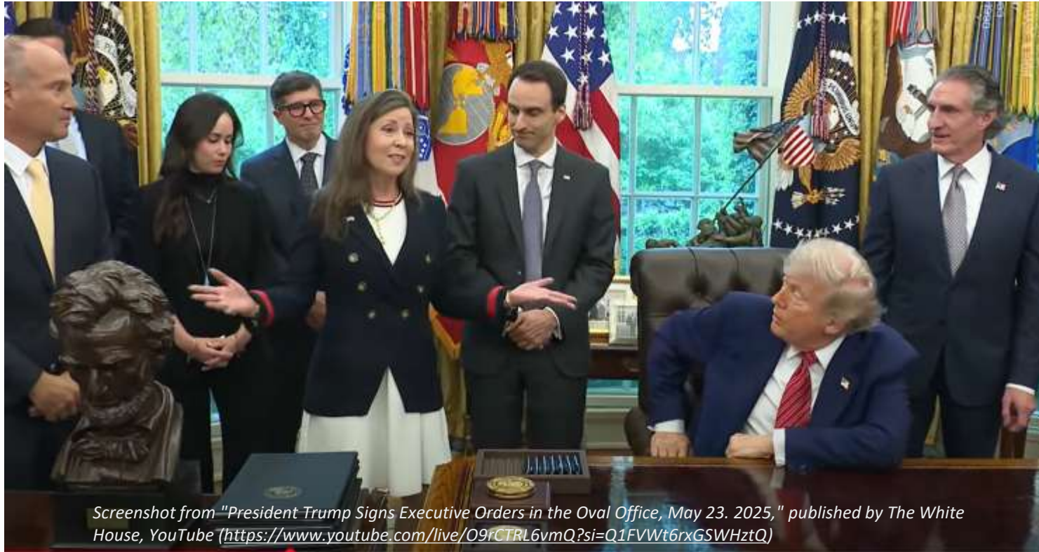
Screenshot from "President Trump Signs Executive Orders in the Oval Office, May 23, 2025," published by The White House, YouTube ( https://www.youtube.com/live/O9rCTRL6vmQ?si=Q1FVWt6rxGSWHztQ )